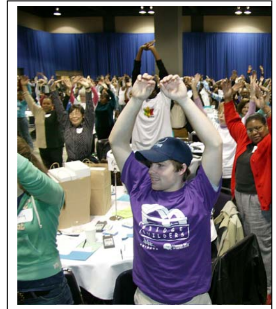
Participants took an exercise break during the Shaping America's Youth® Town Meeting

Participation in the meeting was free and open to all. Outreach was conducted through community organizations, events and print coverage, as well as extensive PSAs on radio and TV. In addition, SAY® organizers offered free childcare, transportation and language translation in order to encourage participation by a diverse cross-section of the Memphis community.